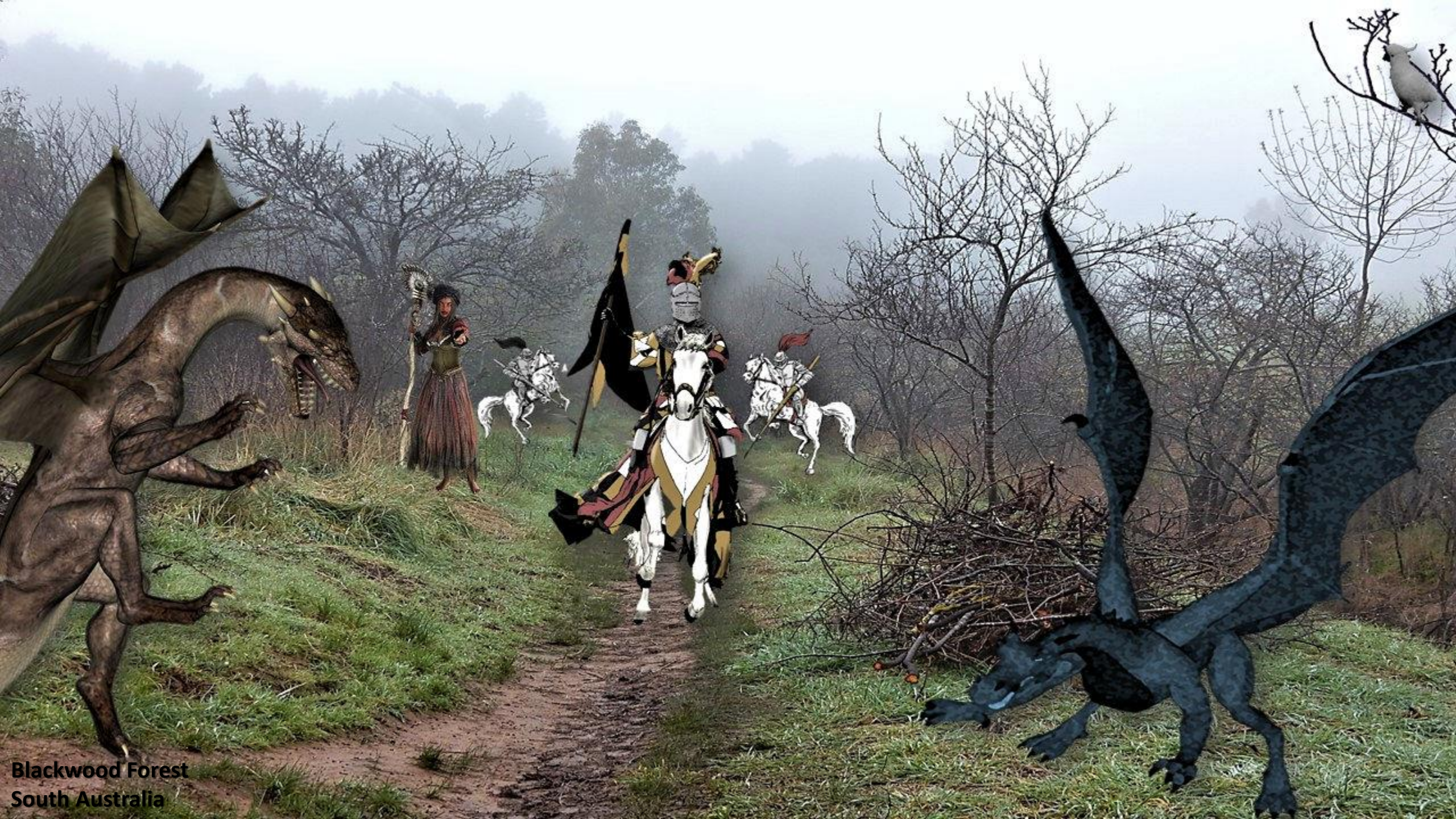
Blackwood Forest South Australia