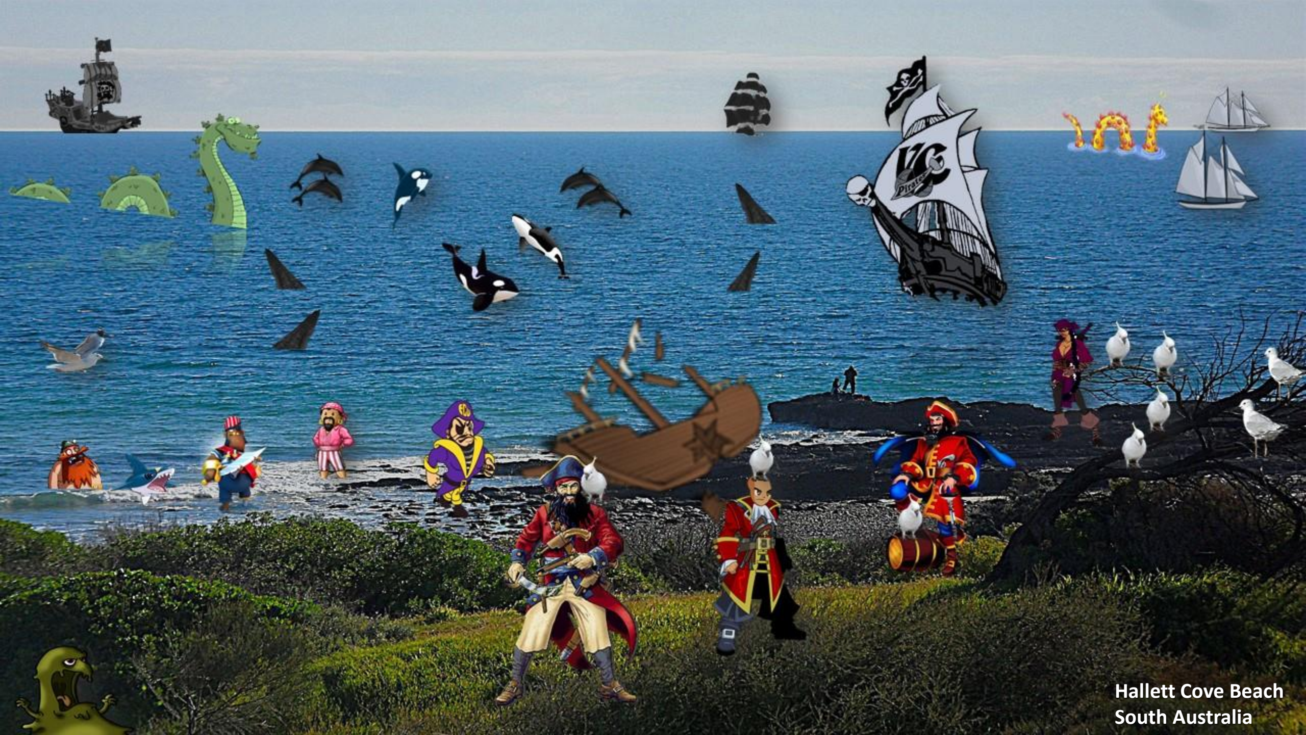
Hallett Cove Beach South Australia