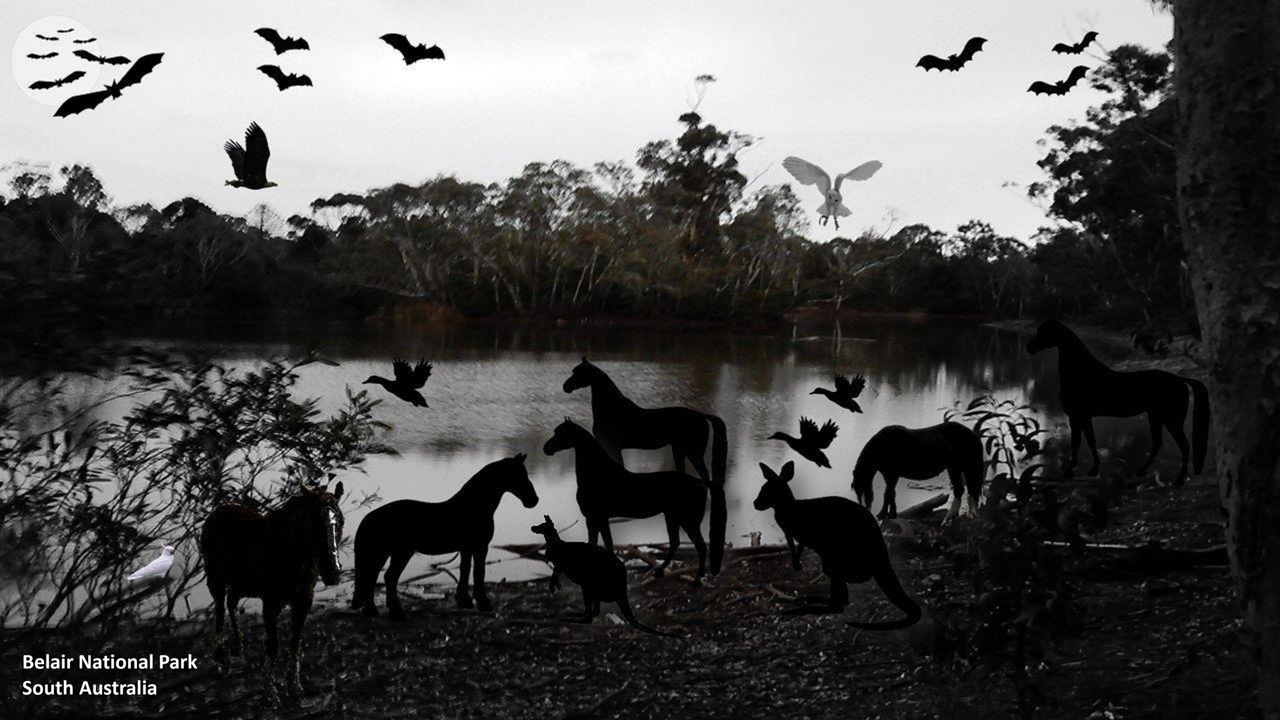
Belair National Park South Australia