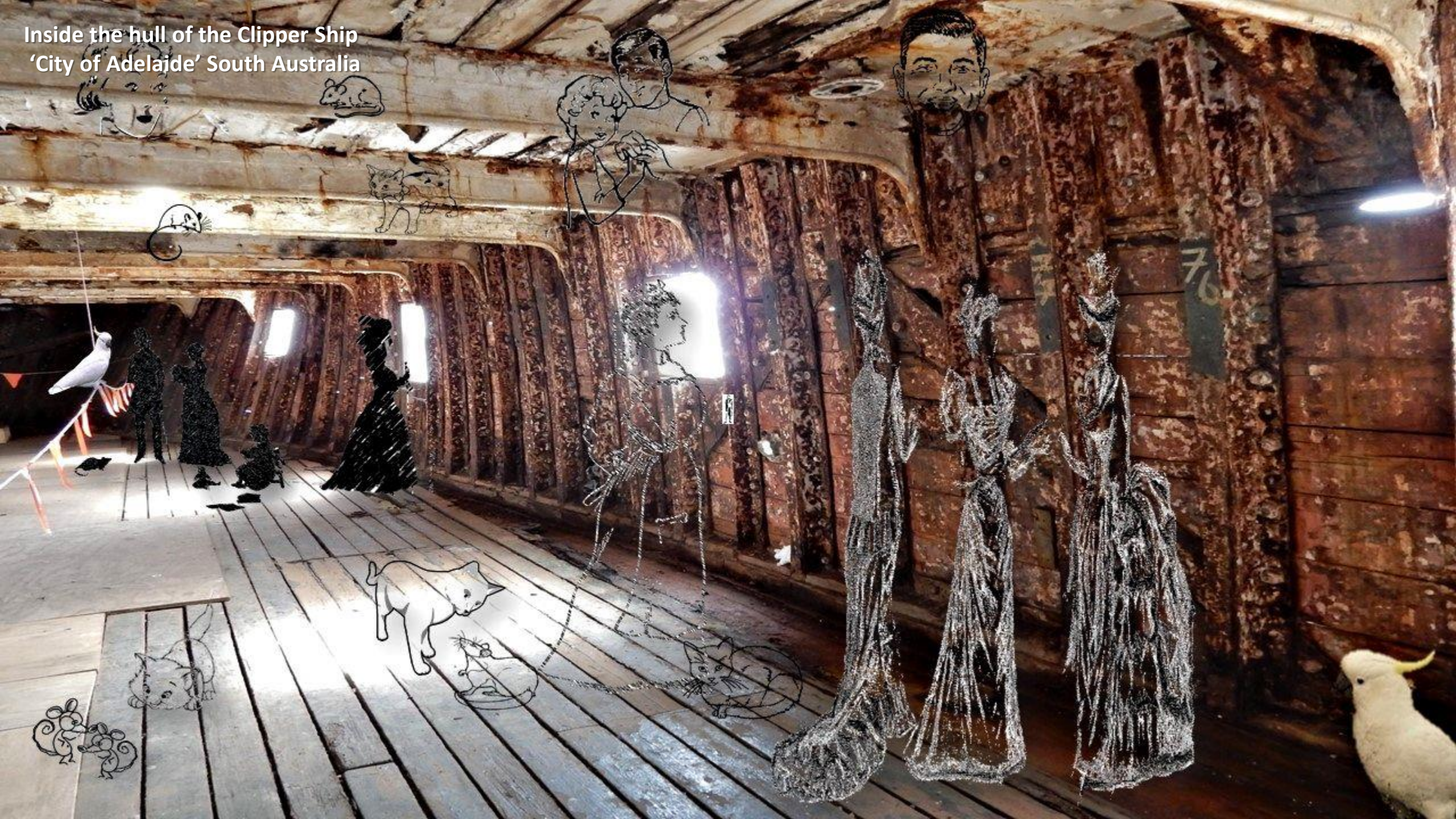
Inside the hull of the Clipper Ship 'City of Adelaide' South Australia